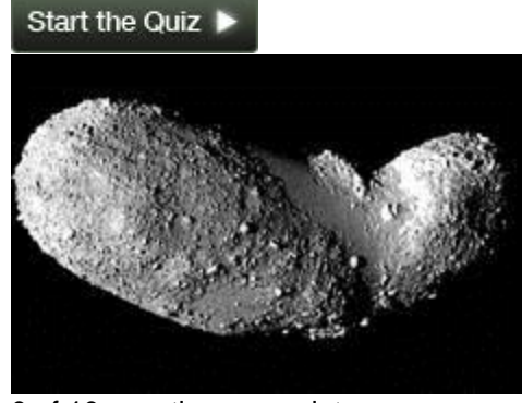
0 of 10 questions complete Start Over More Quizzes

Asteroids are fascinating for lots of reasons. They contain a variety of valuable resources and slam into our planet on a regular basis, occasionally snuffing out most of Earth's lifeforms. How much do you know about space rocks?